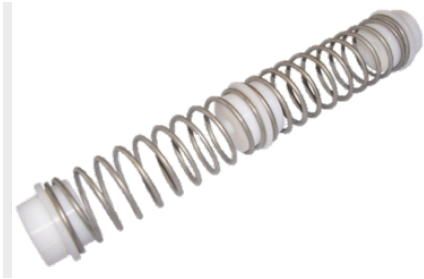
Spring Pack Brake