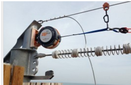
Figure 1: Spring Pack EAD

of springs in a spring pack EAD. If too few springs are used, the rider may bottom out the spring pack which may result in injury or death.